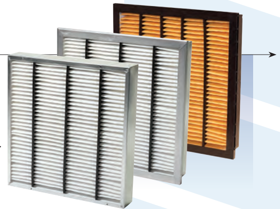
4" QualityFlow, with and without Header